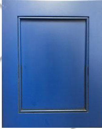
New Castle w/ 826 Mldg