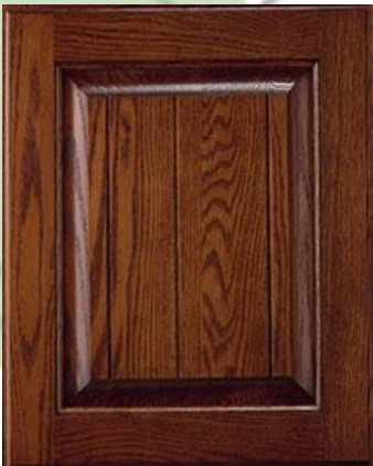
Cape Cod Classic