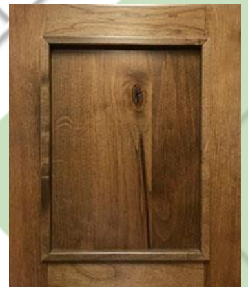
Montana w/ 2007 Mldg