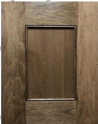
Montana 3-1/4 w/ 23328 Mldg