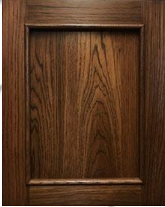
Oregon w/ 1276 Mldg