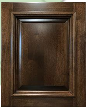
Bel-Air w/ 102 Mldg