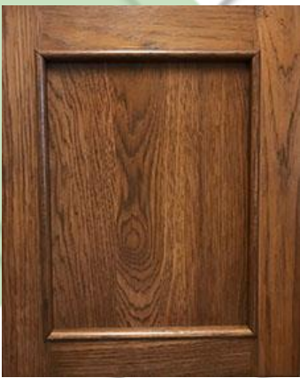
New Castle w/ 1276 Mldg