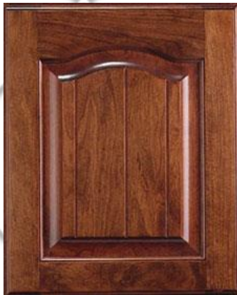
Cape Cod Cathedral